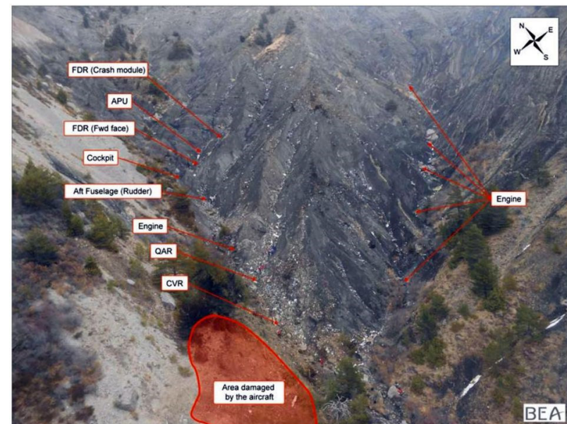
Figure 12 - general view of the accident site