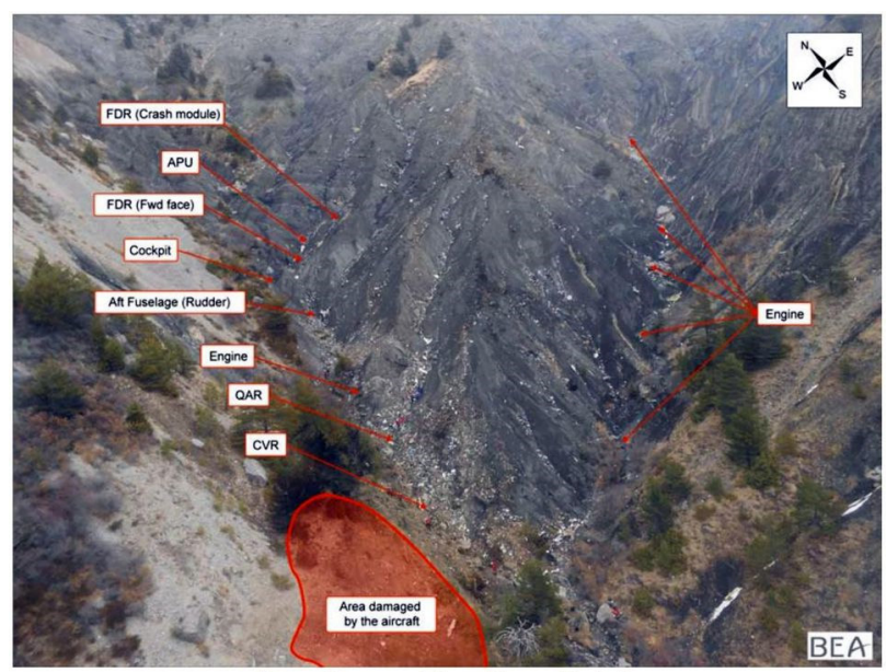
Figure 12 - general view of the accident site