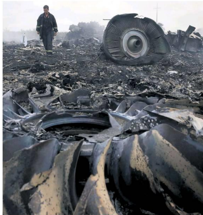
Emergency workers at the site of the crashed Malaysia Airlines Boeing 777 near the village of Grabovo, Donetsk yesterday.

A damning report into extremist infiltration of Birmingham schools has uncovered evidence of "co-ordinated, deliberate and sustained action to introduce an intolerant and aggressive Islamist ethos into some schools in the city".